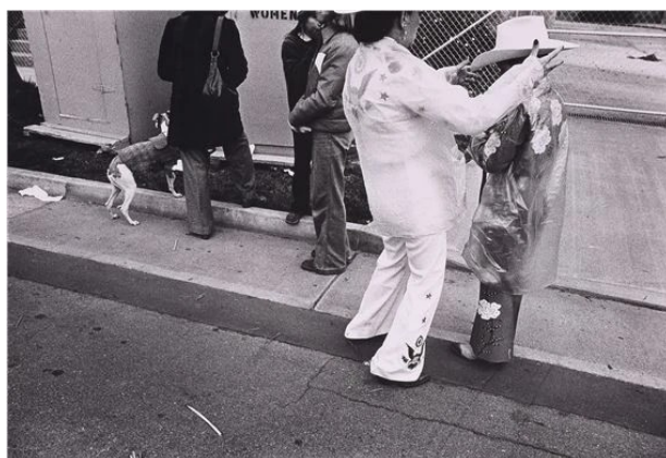
Rose Parade, 1976 ,1976