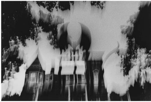
The house of Stephen King (the writer) Bangor Maine