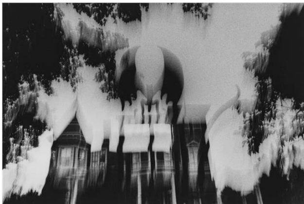
The house of Stephen King (the writer) Bangor Maine

Vintage gelatin silver print on polycoated paper 10.7 x 13.9 in 8.4 x 12.5 in cm 27,2 x 35,5 cm 21,5 x 32