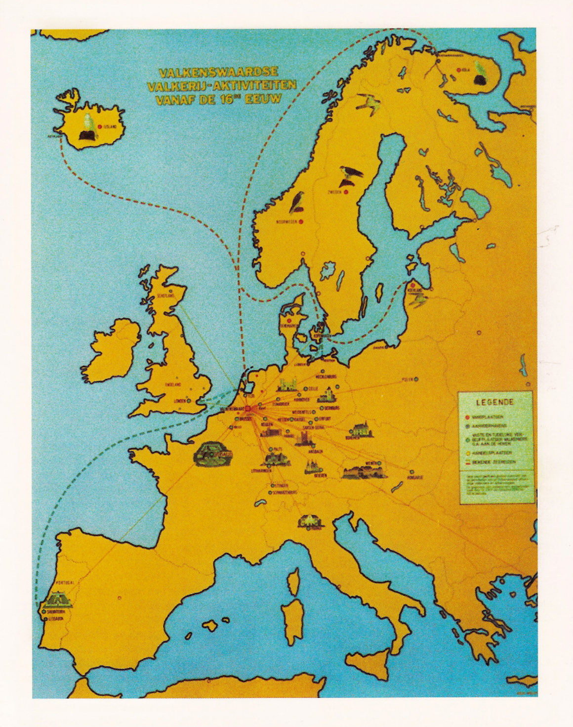
V14*. Reisoverzicht van de Valkenswaardse valkeniers. Vangplaatsen en Europese vorstenhoven waar zij aktief waren, zoals getoond in het Cultuur Historisch Museum te Valkenswaard.*** * Overall picture of catching places and travels of Valkenswaard's falconers, and the European Courts where they were active.