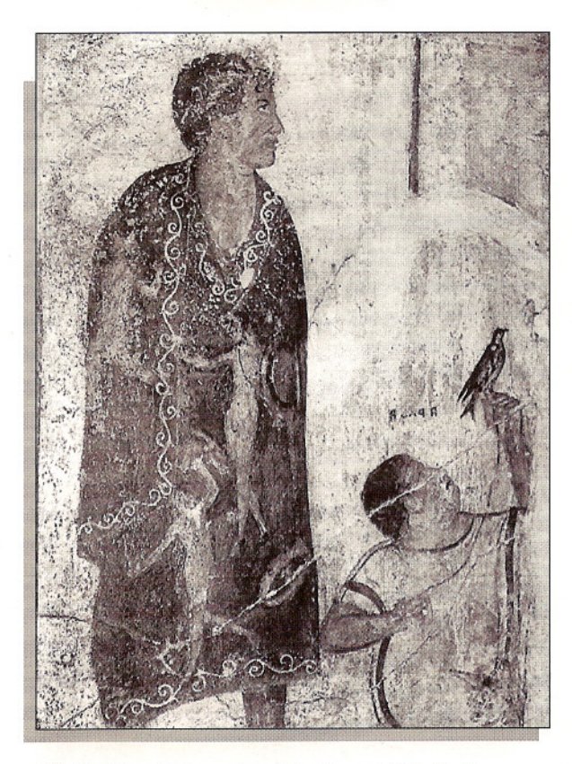
afb. 84 * Etruskische grafversiering, Rome, 340 vóór Chr. * Etruscan tomb.

In the 18th century, royalty and the aristocracy of Europe were passionate about falconry, thus giving rise to an extensive trade in falcons. The capture of falcons became subject to a licensing system, in which the falconers of Valkenswaard played an important role.