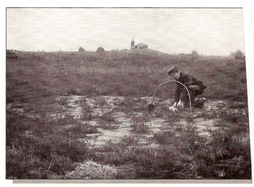
afb. 89 * Het inrichten van de 'legge'; het stellen van een boognet. Op de achtergrond de tobhut en klapeksterheuvels. * Installation of the catching place. Setting up of the bow-net. In the background the hut in which the catcher hides is visible.