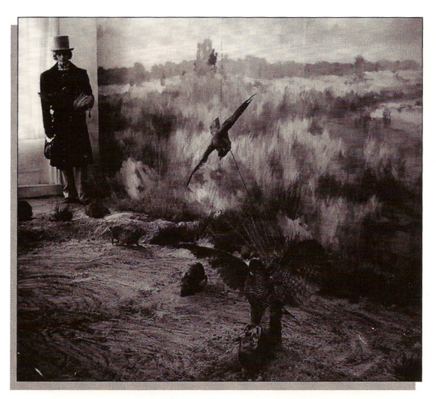
afb. 91 * Gedeelte van het Museum'diorama'. * Part of the 'diorama' at the museum.

hunting grounds. The hunting party follows somewhat later on horseback. When a heron is flying over, on its return from fishing, the falconer removes the hoods from his two peregrines and releases the birds. The heron can escape in two ways: by trying to reach the heron woods as quickly as possible, or by climbing up quickly into the sky. Falcons need to be at least 30 to 50 metres above their prey in order to make their first swoop. The heron will initially manage to escape from the swoop of the first peregrine, and also that of the second. The riders follow the scene of action in anxious suspense. The heron defends itself by flying increasingly higher, but eventually it will become exhausted. One of the falcons will then grab it and tumble with it to the ground. The other one is brought back by the falconer with the lure. The first rider to reach the place receives the plume from the heron's head and may stick this 'aigrette' into his hat as a trophy. The falconer removes the heron from under the peregrine and rings it with a heronband with the name of the club and the year