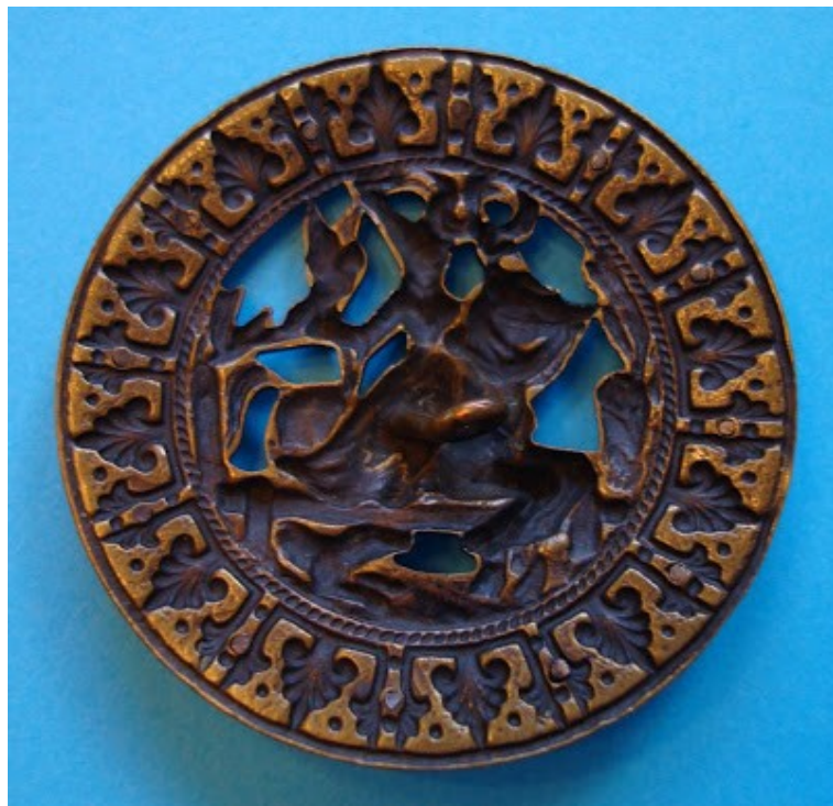
Falcon Huntress - Back

This glorious button is known as the Falcon Huntress. The Lady rides side saddle, and her horse gracefully leaps a fence as her loyal hound runs beneath it. The button is made of one piece stamped and pierced (openwork) brass, with 12 faceted cut steels riveted into the fancy border. She wears a high necked gown and a cone shaped hennin with a flowing veil.