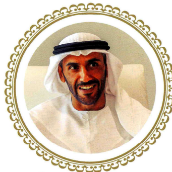
SHEIKH NAHYAN BIN ZAYED AL NAHYAN CHAIRMAN OF THE ABU DHABI SPORTS COUNCIL

The Club will avail and pave the way for falconers' to practice falconry in well-organized competitions and events, motivate grateful UAE falconers to look ahead and move forward steadily to contribute to maintaining and expanding falconry in the UAE.